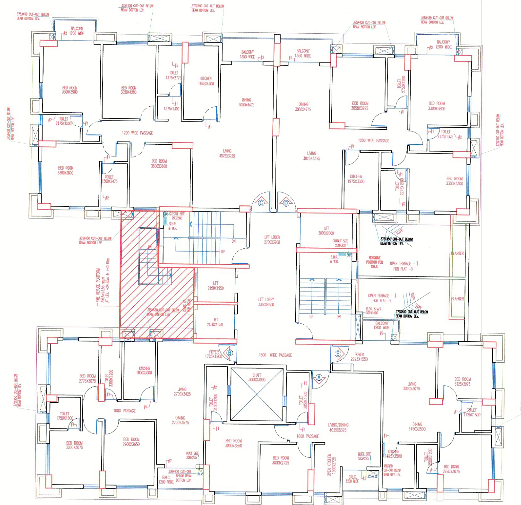
TYPICAL (1ST. TO 17TH.) FLOOR PLAN